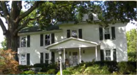
Windy Hill Farm at Bowensville