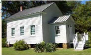
One Room Schoolhouse