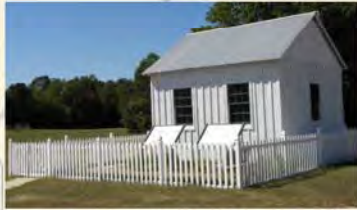
Old Wallville School