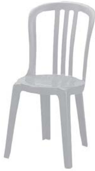
Bistro Chair - white Industrial strength - rated to 300 lbs. 200 available $ 1.50 each