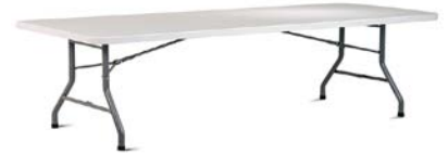
6 ft. rectangular table Seats 6-8 12 available $ 6.00 each

Privacy screening : $40.00 (includes free standing zig-zag panel and panels around trough area.)