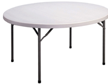
60" Round Plastic Table Seats 6 - 8 25 available $ 7.00 each